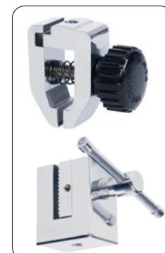
tensile fixture (included)